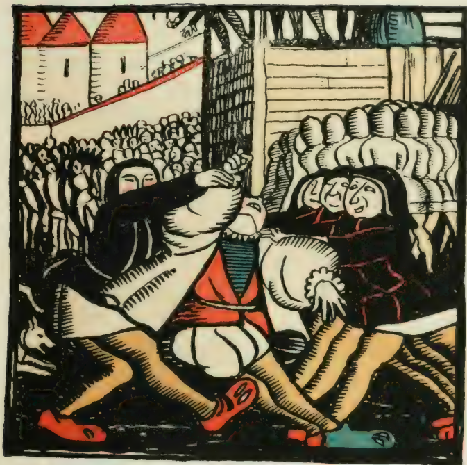
Endeavouring to convey the lardy prisoner to the scaffold.